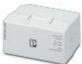
Replacement battery module, lithium-ion, 18.5 V DC, 46 Wh

Battery - STEP-BAT/LI-ION/18.5DC/46WH - 1081355