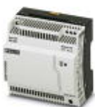
Primary-switched STEP POWER power supply for DIN rail mounting, input: 1-phase, output: 24 V DC/4.2 A

Power supply unit - STEP-PS/ 1AC/24DC/4.2 - 2868664