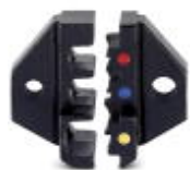
Spare die for CRIMPFOX-RCI 6-1

Replacement die - CRIMPFOX-RCI 6-1/DIE - 1212290