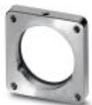
Square mounting flange, Axial seal, 4xM3, flange dimensions: 35 mm x 35 mm

Square mounting flange - RF-Z0003 - 1607905