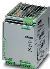
Primary-switched power supply unit, QUINT POWER, Screw connection, SFB Technology (Selective Fuse Breaking), input: 1-phase, output: 48 V DC / 10 A

Please be informed that the data shown in this PDF Document is generated from our Online Catalog. Please find the complete data in the user's documentation. Our General Terms of Use for Downloads are valid ( http://phoenixcontact.com/download )