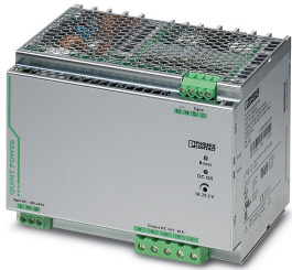
Primary-switched power supply unit, QUINT POWER, Screw connection, DIN rail mounting, SFB Technology (Selective Fuse Breaking), input: 1-phase, output: 24 V DC / 40 A

Please be informed that the data shown in this PDF Document is generated from our Online Catalog. Please find the complete data in the user's documentation. Our General Terms of Use for Downloads are valid ( http://phoenixcontact.com/download )