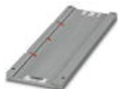
Magazine, for CMS-P1-PLOTTER, for accommodating UC1-TM..., UC1U-TM...